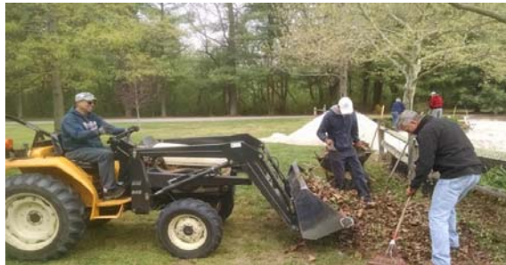
Nine Club volunteers worked to landscape the beach area on Saturday, April 30