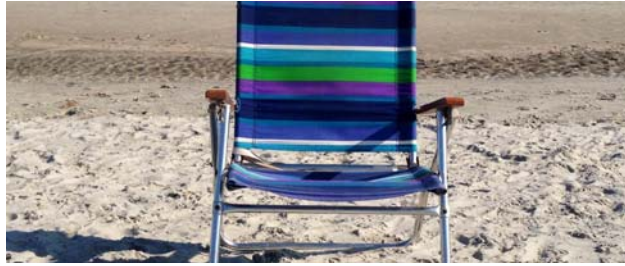
Dust off the beach chairs, it's time to catch some sun!

The 2016 beach season is just around the corner. The lake will open May 28th, for weekends and holidays only till June 18th. Then it will be open 7 days a week, 11am-8pm through labor day.